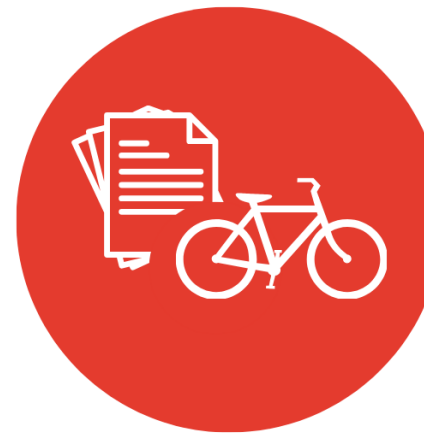
WORK Employer Engagement

Students Everyday Trips Wannabe Car-light Households New Residents near transit