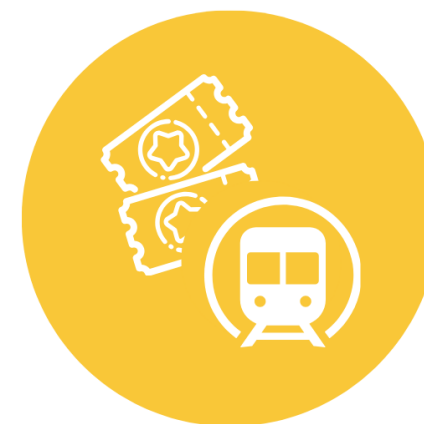
VISIT Visitor Engagement

Large Alexandria Employers Regional Commuters