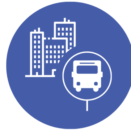
LIVE Residential Engagement

Students Everyday Trips Wannabe Car-light Households New Residents near transit